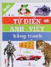
Từ điển Anh - Việt