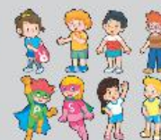
Bộ quần rối