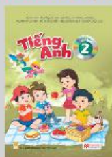
Sách bài tập