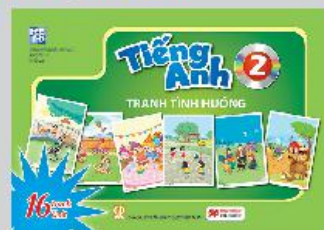
Tranh tình huống