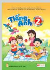
Sách học sinh