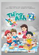
Sách giáo viên