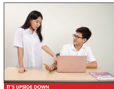
It's upside down

I can use verb constructions with to-infinitives and -ing forms.